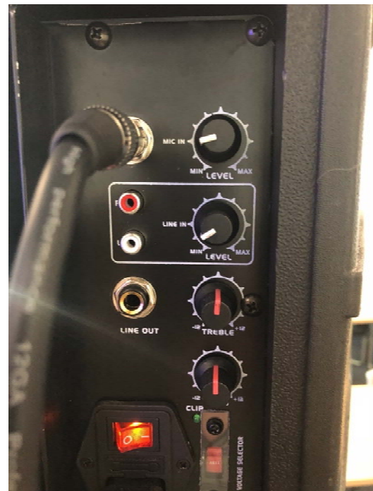
Loudspeakers (updated pictures to follow)