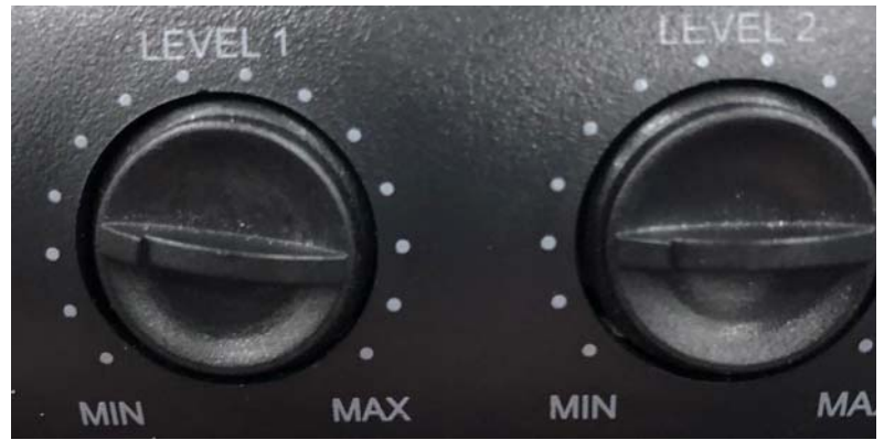
Radio Base station