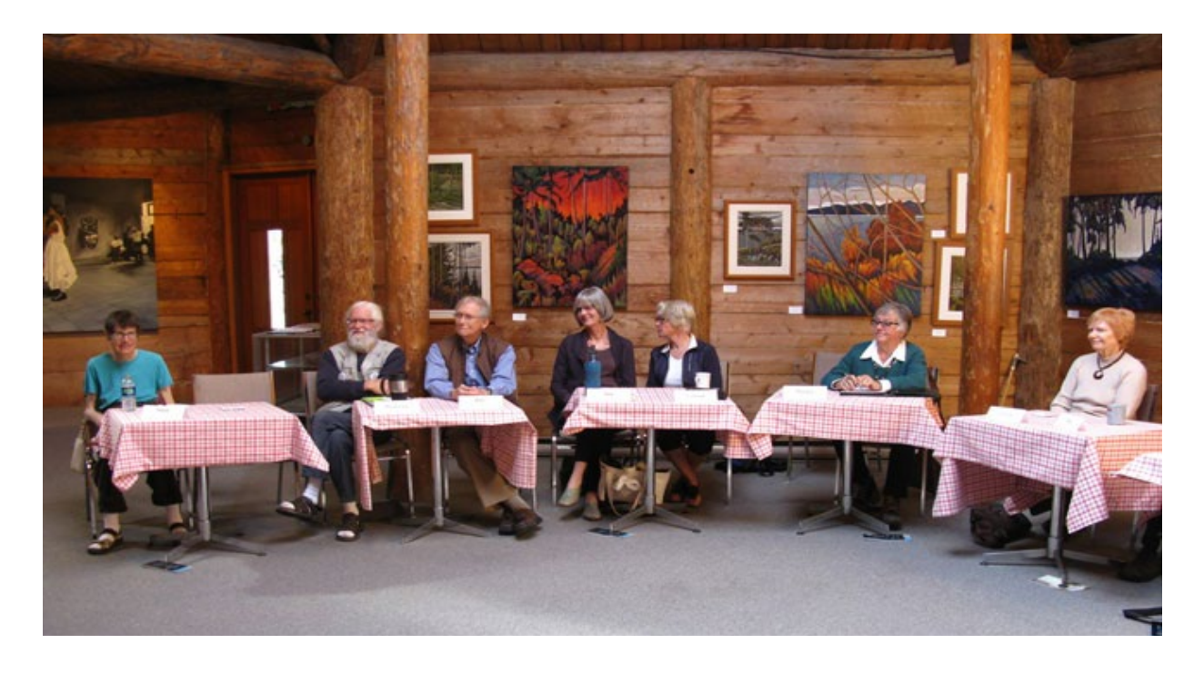
"Conversation Café" at the Sechelt Arts Centre, circa 2013.

The classroom is packed to the point of standing-room only. The atmosphere is raucous with high-spirited chat in a mixed audience of 55 to 85 year-olds gathered for the bi-annual Preview of courses on offer at the Sunshine Coast ElderCollege in Sechelt, BC. The crowd is eager to meet the line-up of instructors slated to present PowerPoint introductions to their areas of expertise, from "How Rivers Shaped Our Planet" to "An Introduction to iPad" to "Law for Seniors." The 15 courses listed range from hands-on "Foraging for Mushrooms" and "Design Your Own Garden" to "Festival of the Written Arts" and "Conversation Café" or "Hot Topics," perennial favourites. When registration opens the following day, some of these classes will sell out within the first half hour and the waiting list to enrol might equal the number of seats available. Such is the popularity of "Guided Autobiography." The students signing up for this course have the experience of most of a lifetime to record and in this venue they will find a voice and learn how to use it. "Trace Your Ancestors" offers a similar appeal but teaches a different set of research skills for looking back at personal history. Other newer courses like "Restorative Justice" and "Anthropocene" might take longer to fill but enrolment at SC ElderCollege has grown from year to year, proving that for retirees, the learning never ends.