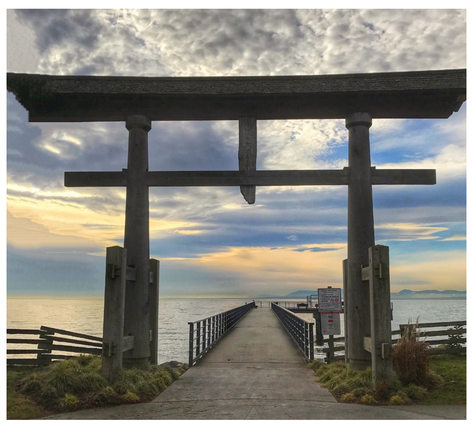
\label{eq:pope} \begin{tabular}{l}  \\ Instructor "Capture Memories with your iPhone" \\ \end{tabular}